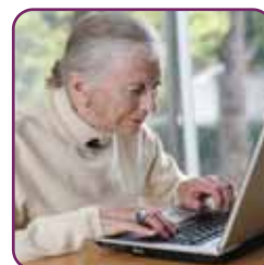
Working later in life?