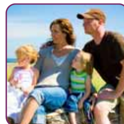
Family income benefit