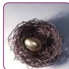
Increased ISA limits